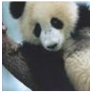
"panda" 57.7% confidence