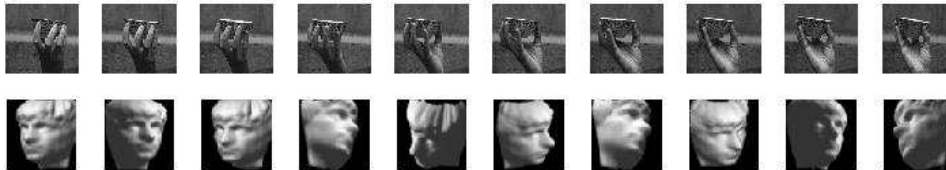
Figure 3: Two image datasets: hand rotation and Isomap faces (example images).

in close second. However, the variance of correlation dimension is much higher than that of the MLE (the SD is at least 10 times higher for all dimensions). The regression estimator, on the other hand, has relatively low variance (though always higher than the MLE) but the largest negative bias. On the balance of bias and variance, MLE is clearly the best choice.