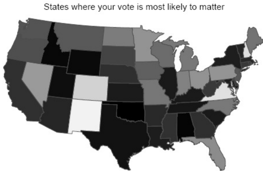
Figure 1. States with lighter colors are those where a single vote is more likely to be decisive. A single vote (or, for that matter, a swing of 100 or 1000 votes) is most likely to matter in New Mexico, New Hampshire, Virginia, and Colorado, where your vote has an approximate 1 in 10 million chance of determining the national election outcome. Alaska, Hawaii, and the District of Columbia are not shown on the map, but the estimated probability of a single vote being decisive is nearly zero in those locations.