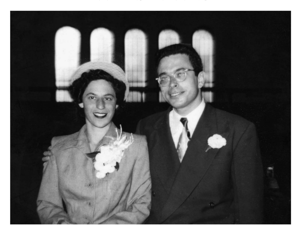
FIG. 1. Wedding photo (1949).