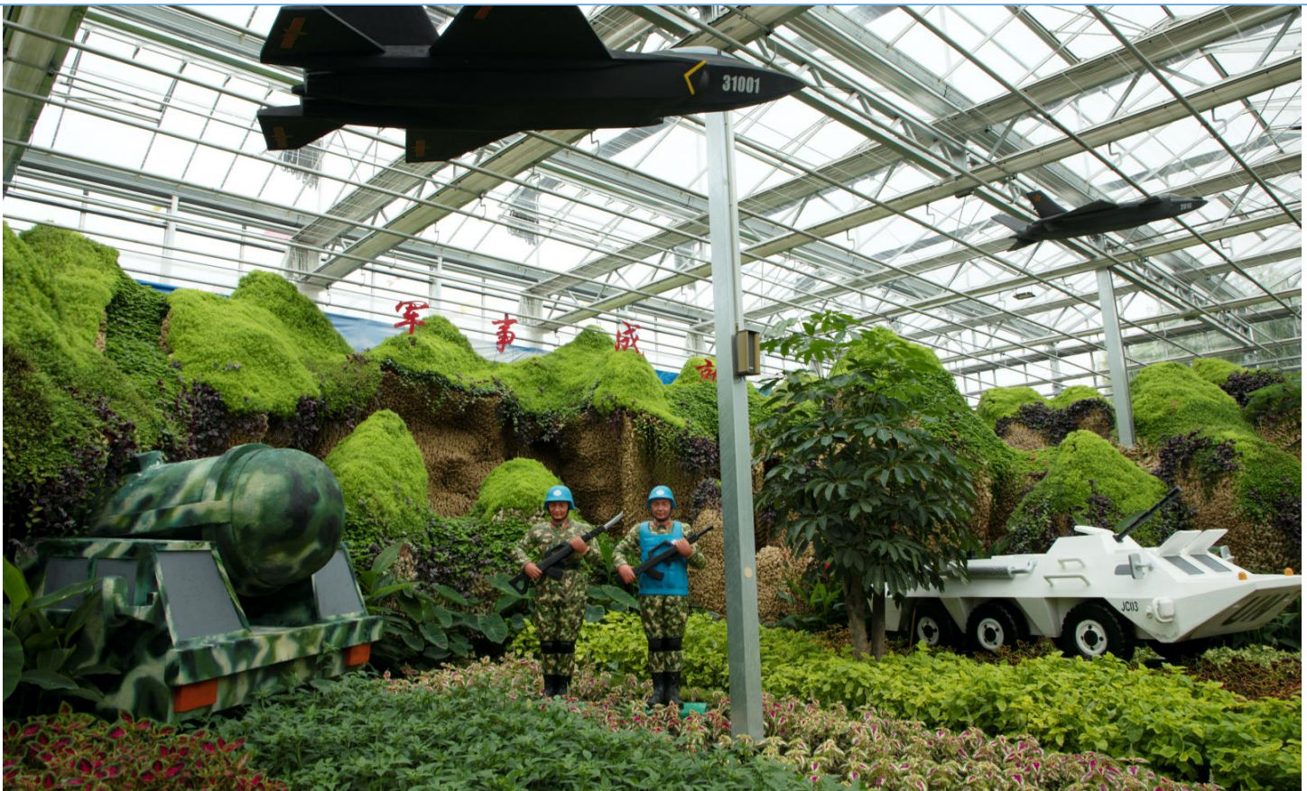
Exhibiting military equipment in Changchun, China, August 2019

As a result, historians and foreign policy experts are often bad forecasters. In 2005, one of us, Philip Tetlock, published a study demonstrating that seasoned political experts had trouble outperforming “dart-tossing chimpanzees”—random guesses—when it came to predicting global events. The experts fared even worse against amateur news junkies. Overconfidence was the norm, not the exception. When experts expressed 100 percent certainty that events would occur, those events materialized only 80 percent of the time. Yet there were pockets of excellence amid this unimpressive performance. Those who were surest that they understood the forces driving the political system (“hedgehogs,” in the philosopher Isaiah Berlin’s terminology) fared significantly worse than their humbler colleagues, who did not shy from complexity, approaching problems with greater curiosity and open-mindedness (“foxes”).