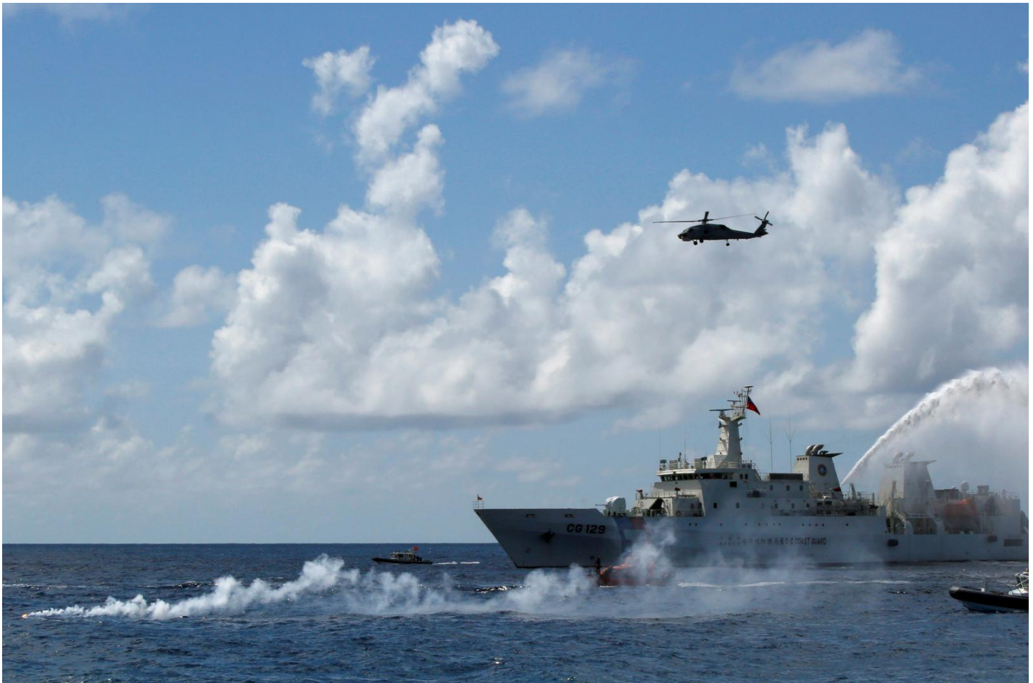
Taiwanese ships in the South China Sea, November 2016

These questions are useful both individually and collectively. Knowing that top forecasters see an increased chance of China controlling the island (from, say, a ten percent probability to a 20 percent probability), for instance, would provide immediate tactical value to the U.S. Navy. It should not necessarily tip the balance in the debate over whether China will be “triumphant,” but if all the forecasts resulting from the question cluster are trending in the same direction, the United States may want to recalibrate its strategy. As forecasts change and individual questions are answered by the course of events, the view of the far-off future becomes a little bit clearer. Analysts can then update their scenarios and generate new clusters of questions. They can thus develop a continually evolving sense of plausible futures, as well as a probabilistic estimate of which policies will yield the most bang for the buck today.