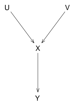
Figure 1. Directed Acyclic Graphs.

Two of the central ideas behind the SGS discovery algorithms are the 'Markov condition' for graphs, developed by Kiiveri and Speed (1982, 1986), and the 'faithfulness assumption' due to Pearl (1988).<sup>3</sup> These are purely mathematical assumptions relating graphs and probabilistic independence. (There will be an informal discussion of these assumptions, below.) SGS focus on a